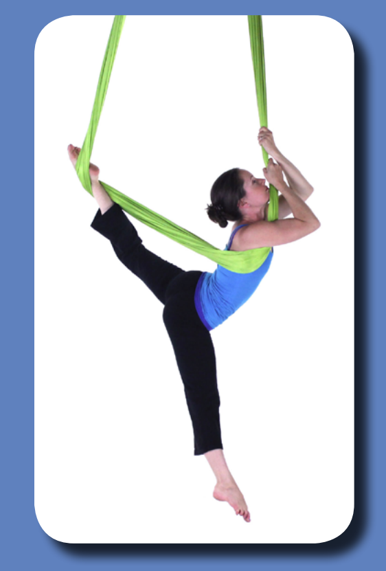
A front arabesque variation from page 27.