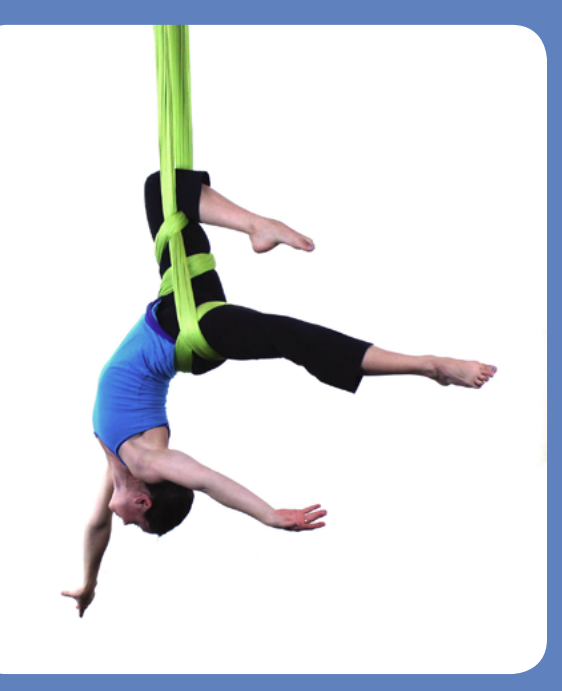
From cupid's sequence on page 57.

Falling Star ... 44 Half-Catcher's to SBB ... 45