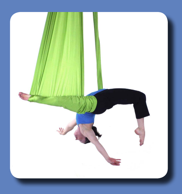
This move is located on page 89