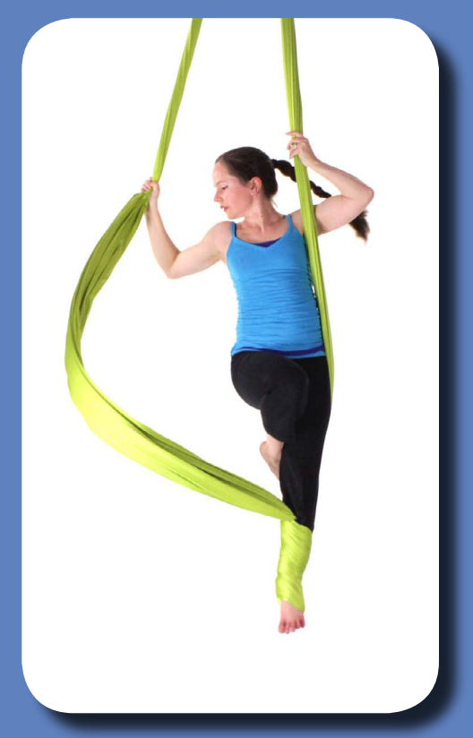
This move is located on page 83.

This is the first time where the level of the book will exactly match up with the volume number. The fact tha I am now running a studio has largely influenced this decision. My goal is to have this be the case with all future manuals, on any apparatus. The entire curriculum that is outlined in these books and in our online video