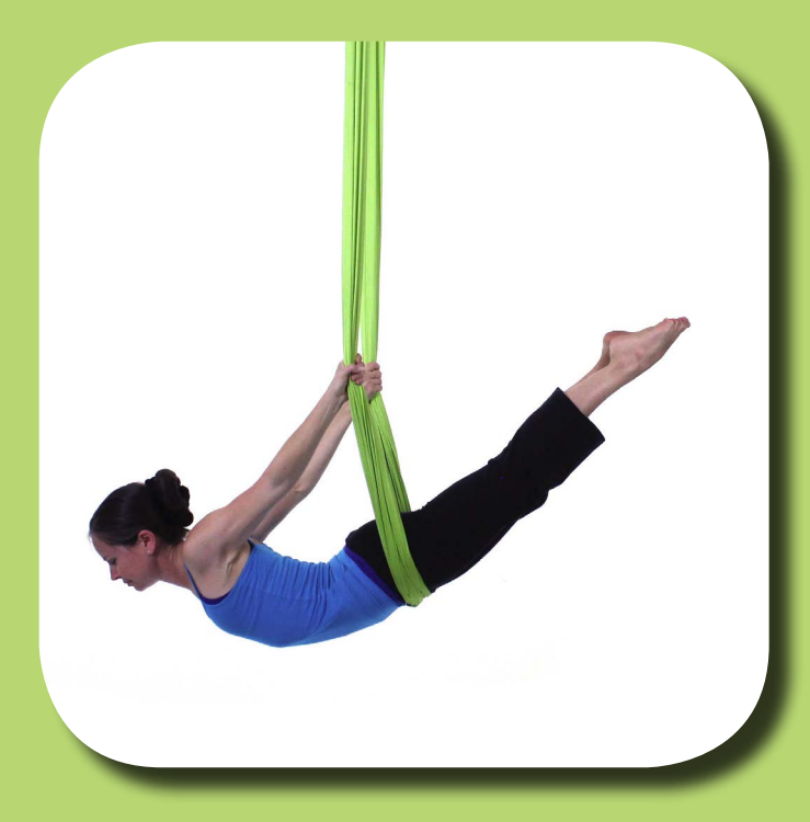
This move is located on page 39.

Level 0 Poster .... 109 Level 1 Poster .... 111 Index.....112 Acknowledgments.....113 About the Author.....114