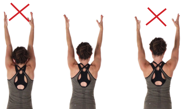
Mid-range shoulder placement is important when hanging in the air. The trapezius muscle does most of the work here.

This is a great exercise to do on the ground to allow your brain to connect with your shoulders and check in. You should always be aware of how you are holding your shoulders. Too much engagement and they become locked up, putting too much pressure on the joint. Too little engagement and the muscles hand off the job of engagement to tendons and ligaments which can easily tear. Much of aerial is devoted to finding the right shoulder placement to prevent injury. Other sports use the term "shoulder packing" to describe this process of properly placing and engaging the shoulders in the right amount to maximize efficient movement while minimizing shoulder injury. Keep questioning. Keep learning. Keep studying. There's too much to cover in this book alone.