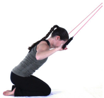
pull-down for pull-up training

One very important concept of a warm-up for strength training is the idea of progressive loading. This is a concept that works both for the short term and for the long-term. It is the idea that we are all going to progressing from easy to hard. Your warm-up should consist of movements that are relatively easy for you. For example, if you are going to be doing a lot of overhead pulling movements (as we do in aerial), perhaps you could start with pulling down on a resistance band to warm-up your pulling muscles. If you are not strong at all with your pull-ups yet, this could be your workout if this is hard for you. If it's easy for you, then it is your warm-up. Next, you move on to the next hard thing, whether that's within one workout or next week as you get stronger.